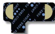
Non-Adhesive Small Sensor 2.20" x 0.75"