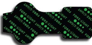
Large Sensor 3.625" x 1.5"

The FORE-SIGHT system has FDA clearance for the non-invasive, continuous measurement of absolute cerebral tissue oxygen saturation for neonates, infants, children and adults.